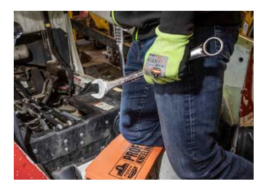
TenaLux ^{\text{m}} yarn gives workers the most breathable A4 cut protection they can get - NO irritating steel or glass fibers.