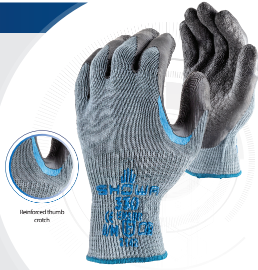
Reinforced thumb crotch