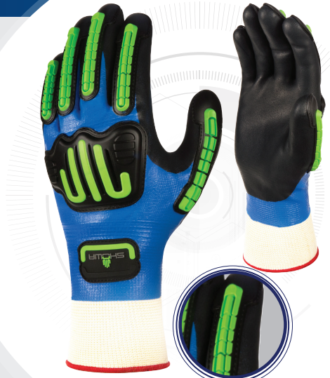
Flexible and Durable TPR Shields