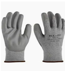
Glove model TEK5C

EN ISO :21420:2020 & Dexterity 5 EN 388:2016 +A1:2018 (4X43C)