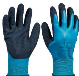
Glove model H2O

EN 420 : 2003:+A1:2009 & Dexterity 5 EN 388:2016 (2131X)