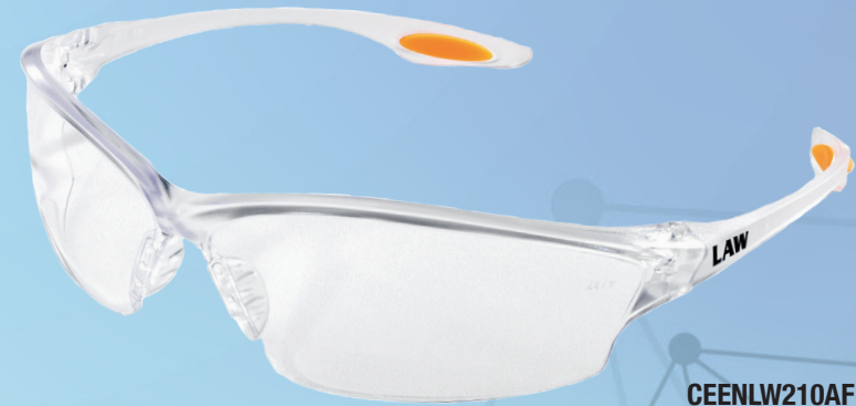
CEENLW210AF Clear Lens Anti-Scratch | Anti-Mist | C1F